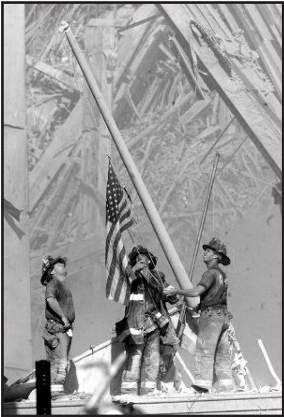
Firemen raised a flag where WTC was.