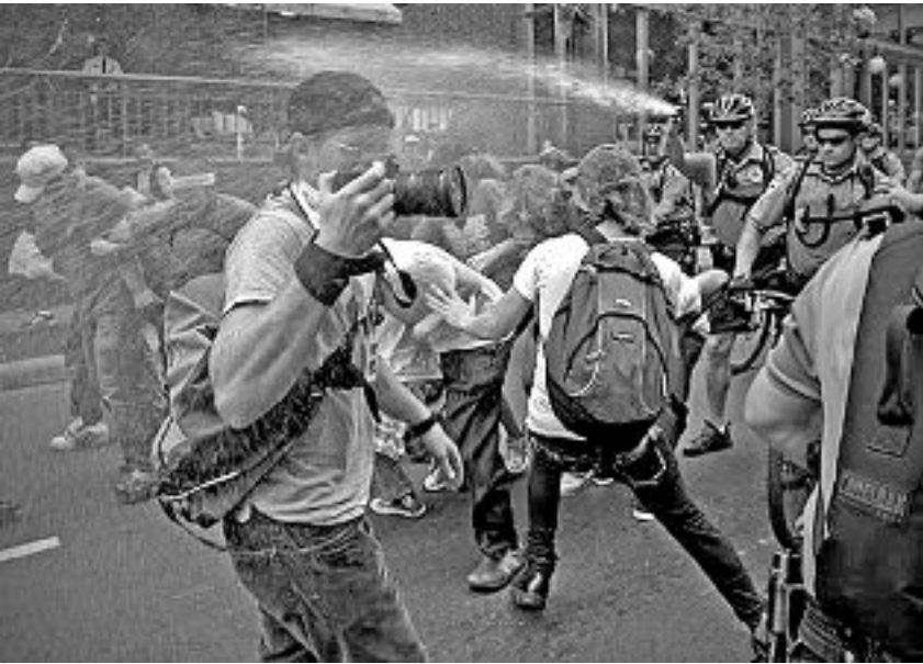
Sept. 1, 2008, Minneapolis.

running. The next bridge was also barricaded, the Marion St. Bridge. The only way to go was Northwest into a neighborhood. Sounds of explosions rocked the night air. I headed in that direction as I received a twitter (text message), "THE PRESS ARE NO LONGER SAFE!" Other texts rolled in reading, "Fox News gassed" and "KARE 11 reporter arrested." As the explosions grew louder, I saw bluish-purple gas rising from behind a building. I ran into the Sears parking lot where the action was. Police were everywhere. It was impossible to know where to go. There were small packs of police and National Guardsmen everywhere I turned.