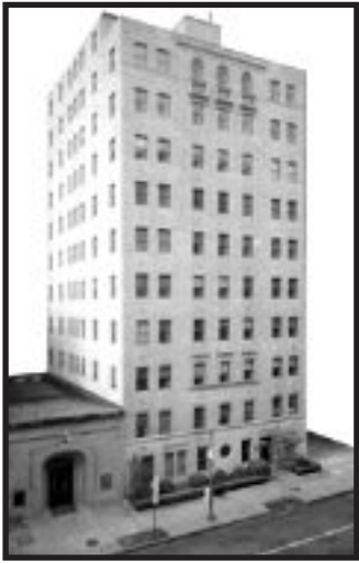
Grange Headquarters, Washington, D.C.

Whereas: There are several companies in the United States of America who have invented and are marketing electronic voting machines to be used for public elections throughout